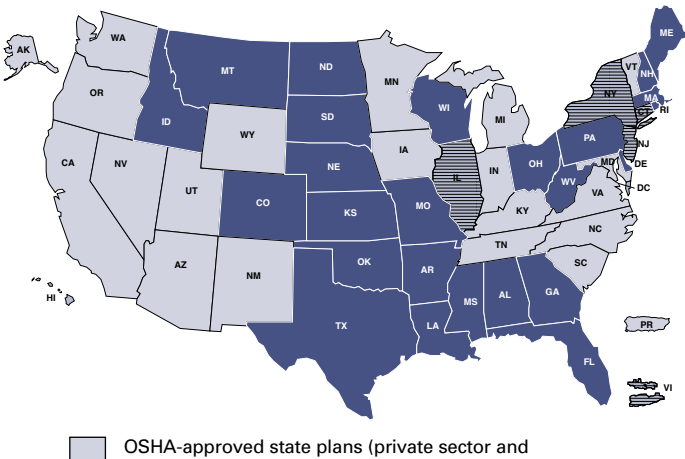
OSHA-Approved State Plans