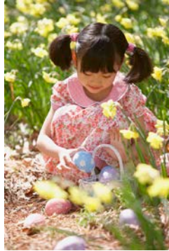
Copyright © Texas Education Agency, 2012. All rights reserved.