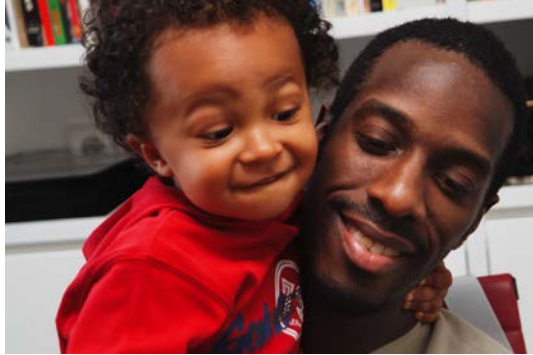
Copyright © Texas Education Agency, 2012. All rights reserved.