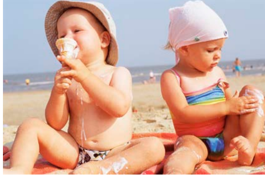
Copyright © Texas Education Agency, 2012. All rights reserved.